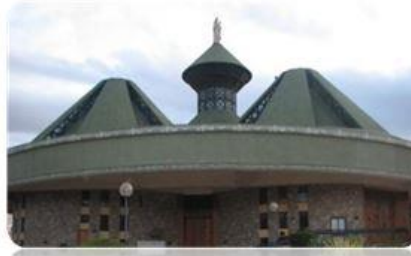
Don Bosco Church